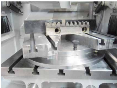
Special clamping device