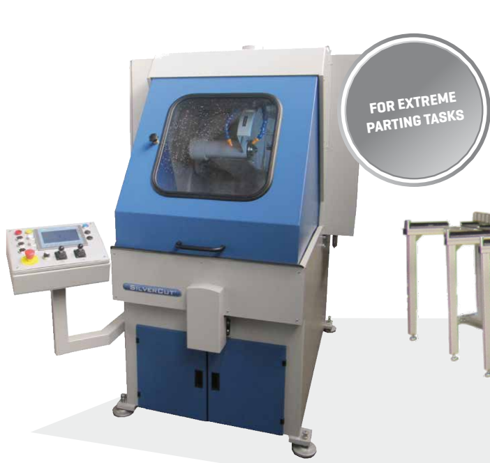
CN-432 series Partial or fully automatic parting system for wet cut-off grinding procedure