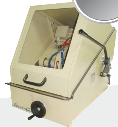
VN-300 series Table cut-off machines

To date, there are more than 2,800 SilverCut systems successfully in use. That speaks for itself.