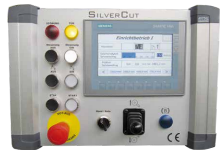
Control panel with touch Display and joysticks for all servo axes of the cutting wheel.