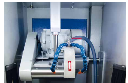
An insight into the machine interior.