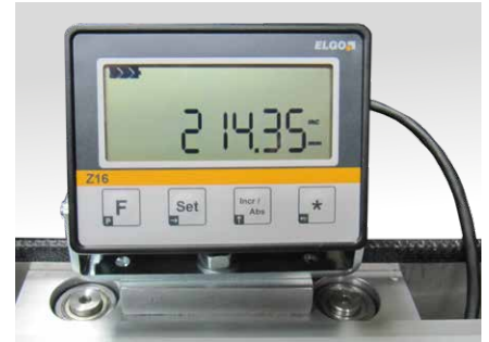
Display device for the digital workpiece stop with a positioning resolution of 0.05 mm.