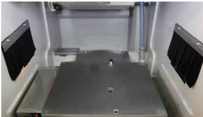
Cross table with indexing and recognition of quick-change system.