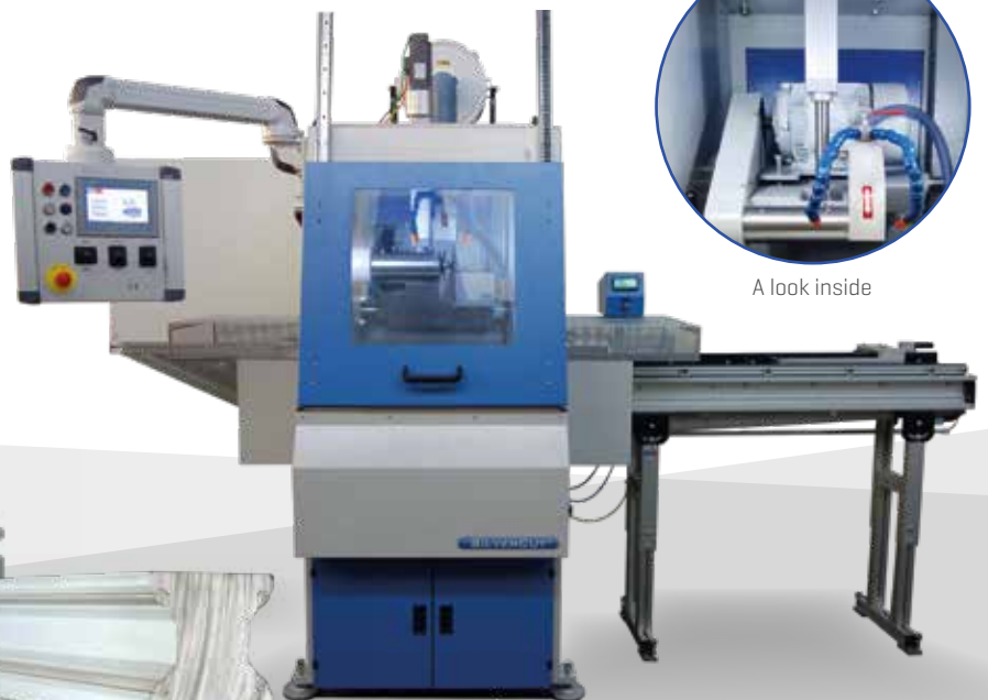
A look inside

All SilverCut machines are certified with the CE mark in accordance with VDE and UVV guidelines.