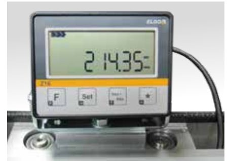
Display device for the digital workpiece stop with a positioning resolution of 0.05 mm.