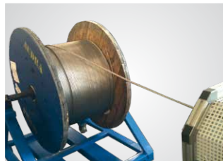
Fully automatic coil feed