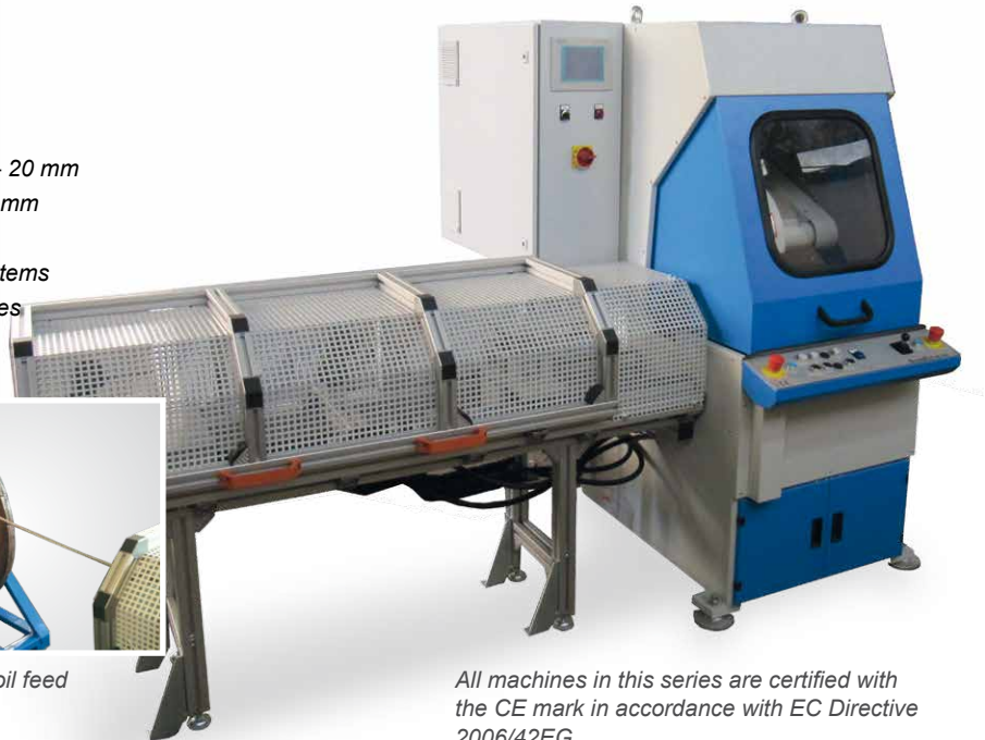
All machines in this series are certified with the CE mark in accordance with EC Directive 2006/42EG.